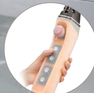
Optional silicone cover for the pendant