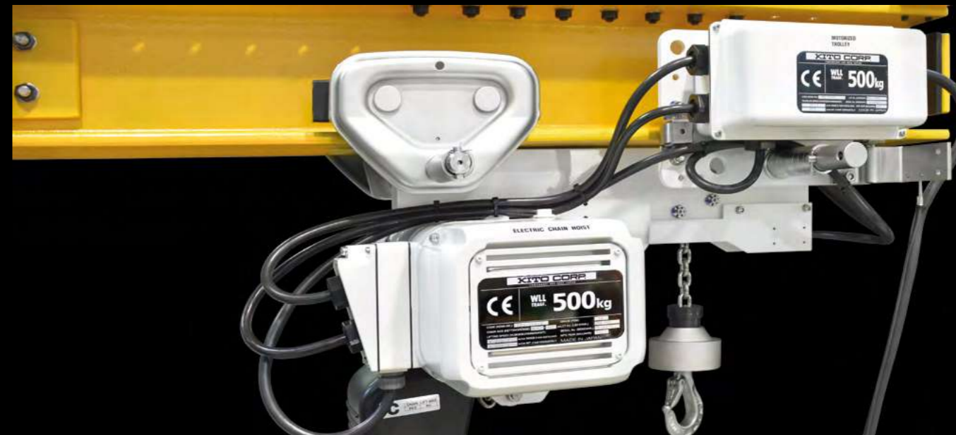
FER2 FOOD GRADE ELECTRIC CHAIN HOIST Custom build