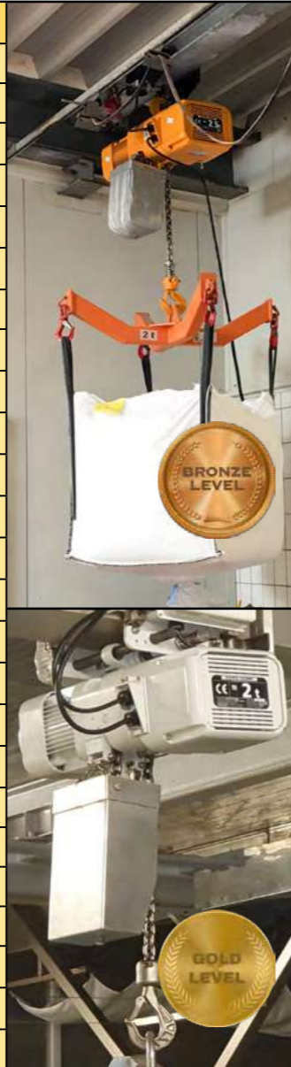
*2,500 kg - 5,000 kg with white epoxy painted load hook