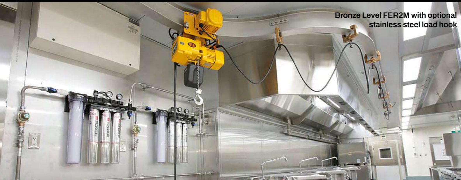
FER2 FOOD GRADE ELECTRIC CHAIN HOIST 500 kg up to 5,000 kg load capacity